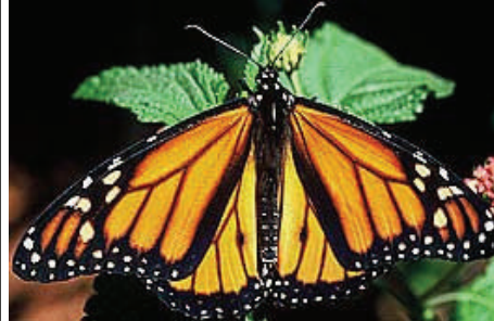
Monarch (Danaus Plexippus)